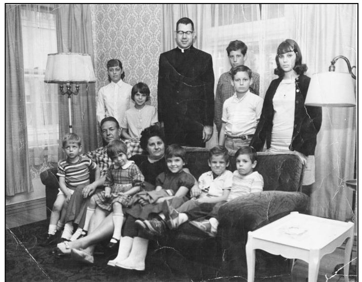
Left top: 6th grade class photo for class of '74 Left bottom: 5th grade class photo for class of '74 Above: Gonzalez family with SJ Jesuit in home