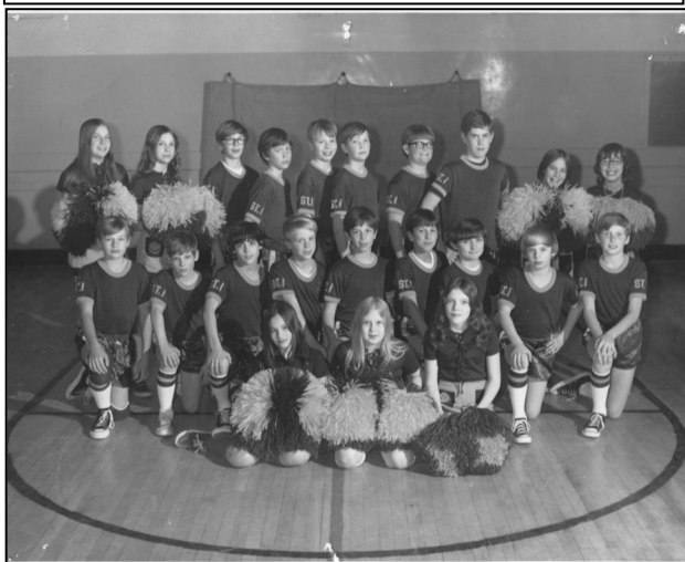
St. Ignatius basketball team and cheerleaders.